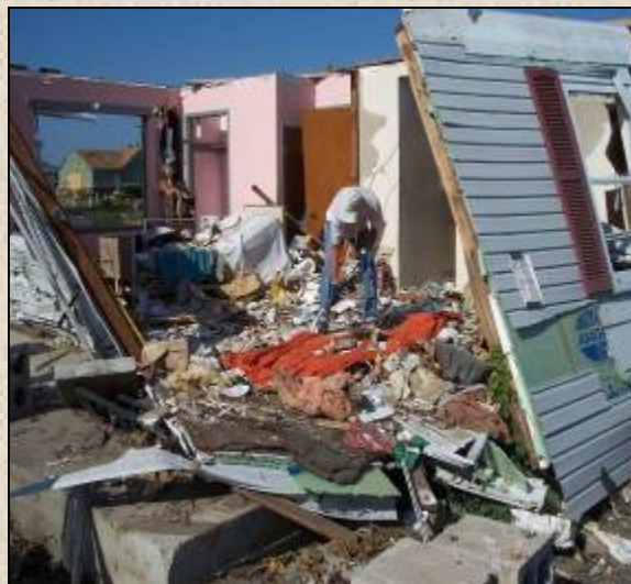
The clean up continues.