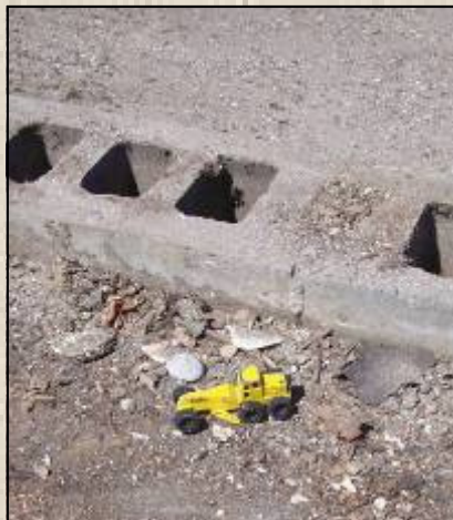
A toy truck amid the rubble.