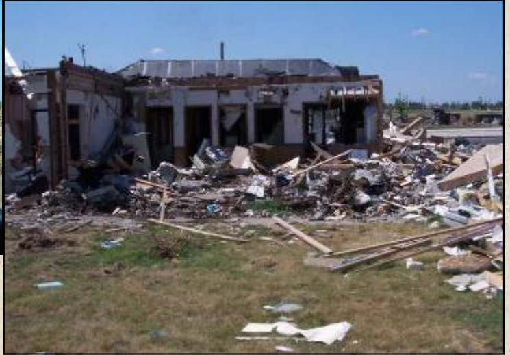
A house destroyed by the May 22nd tornado.