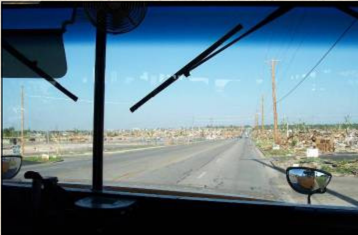
The Mission team approaching the disaster area.