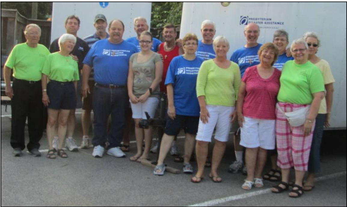
The entire Community Presbyterian and Ozark Presbyterian 2011 PDA Mission Team